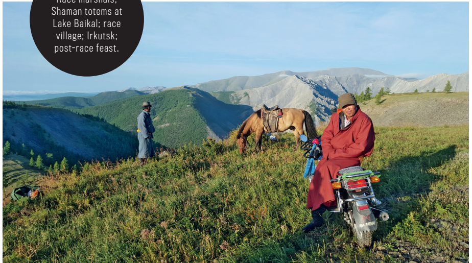
Clockwise: Race marshals; Shaman totems at Lake Baikal; race village; Irkutsk; post-race feast.

In contrast to some of the bigger, more crowded European races, what followed was more intimate and relaxed. The start was cool and peaceful. Headlamps bobbed through the forest, and then the